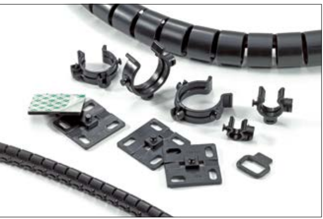
The Helawrap accessory set for bundling, fixing and protecting multiple cable runs.