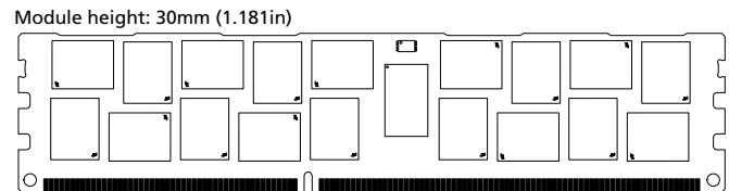
Figure 1: 240-Pin RDIMM (MO-269 R/C E2)